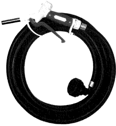
JME Gravity Flow DEF Kits for Totes