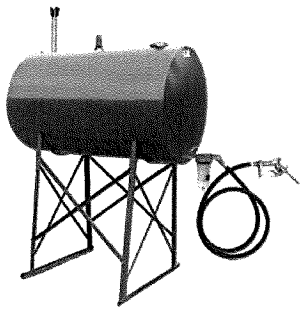
JME Gravity Flow Fuel Tank On Stand - 150 Gallon