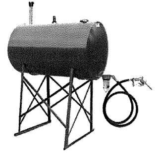
JME Gravity Flow Fuel Tank On Stand - 270 Gallon