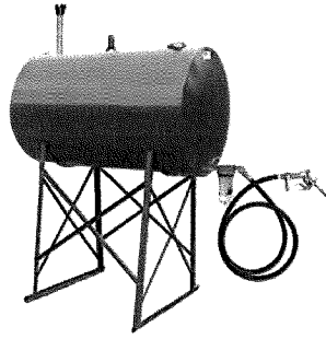
JME Gravity Flow Fuel Tank On Stand - 150 Gallon