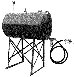
JME Gravity Flow Fuel Tank On Stand - 270 Gallon