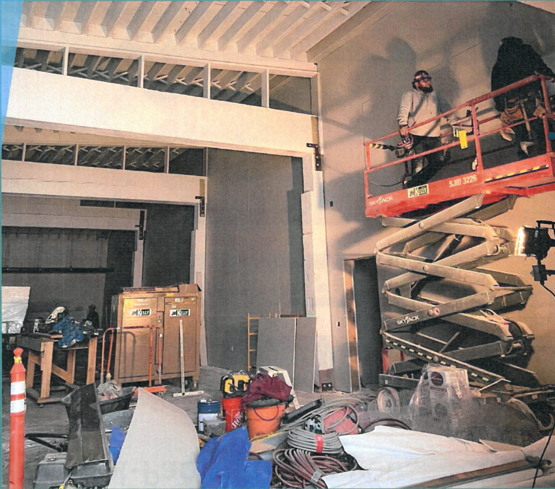
St Helen's Food Bank Interior Construction

We make Community Development Block Grants easy