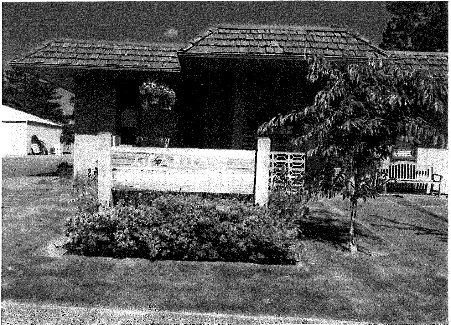
Gearhart City Hall