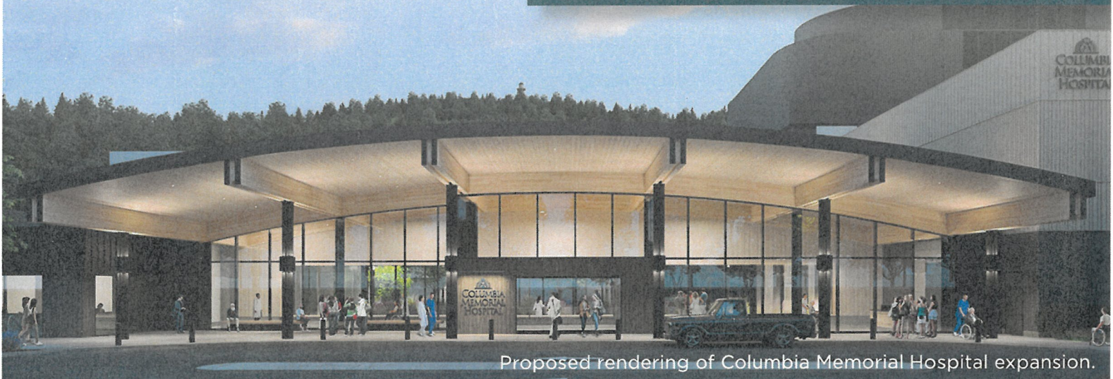
Proposed rendering of Columbia Memorial Hospital expansion.

CMH's main campus is located in Astoria, Oregon. We also operate outpatient medical and urgent care clinics in Warrenton and Seaside. CMH continues to grow and remains dedicated to serving and improving the health of our neighbors.